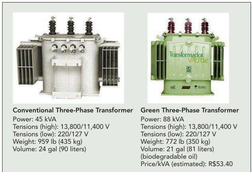
Comparison of a conventional transformer with a green transformer.