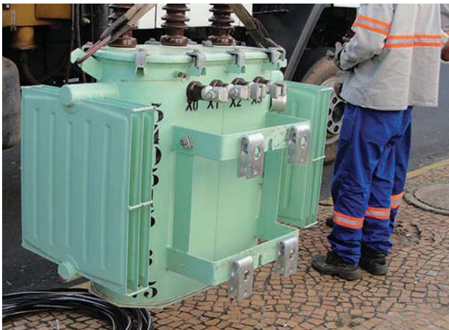
A CPFL Energia technical team installs a 45-kVA size-rated 75-kVA green transformer.