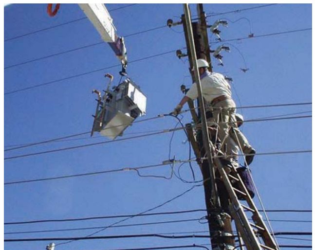
Linemen install a green transformer on an overhead distribution line.

After analyzing the reduction of losses versus loading, it was realized, for transformers with a low load factor, the loss reduction is higher, reaching 40% in some cases. These trans-