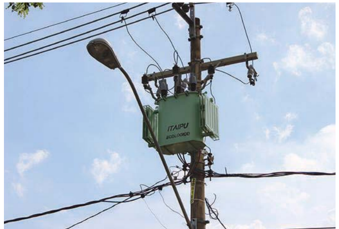
This is an example of a 45-kVA size-rated 75-kVA green transformer in a typical pole-mounted CPFL installation.